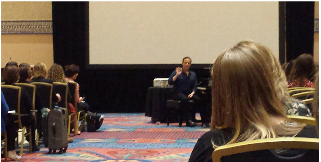
Workshop with Jim Brickman.