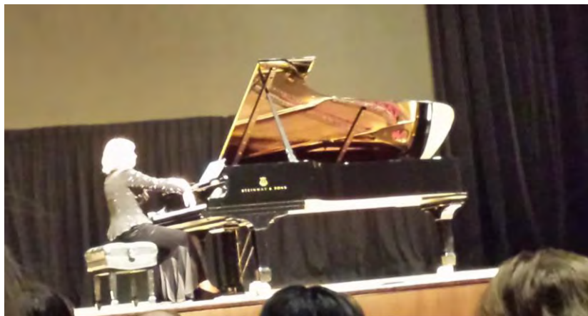
Ingrid Fliter delighted the convention audience in a solo recital.